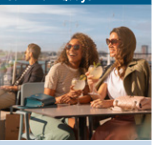
Over 30 restaurants, bars and coffee shops offering a range of menu options, many with waterside views.