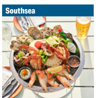
Great range of independent restaurants and bars offering food from across the globe including seafront eateries and fish and chip restaurants.